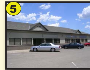
820 Concord 1,100 SF