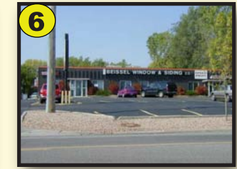
1635 Oakdale 2,000 SF