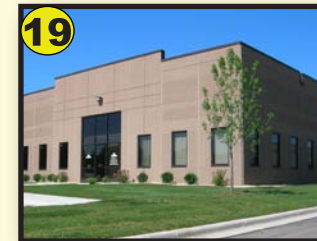
173 BridgePoint Dr 3,100 to 6,200 SF $79/SF