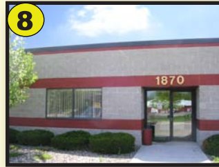
1870 50th Street 400 to 1,620 SF