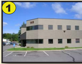
149 Thompson Ave 727 to 3,690 SF