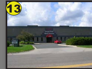
220 Hardman Ave 8,000 to 23,000 SF