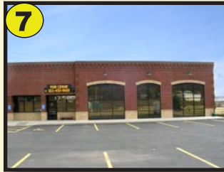
100 BridgePoint Way 2,535 SF