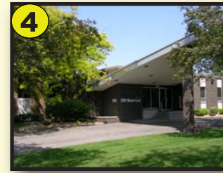
245 Marie Ave 650 SF