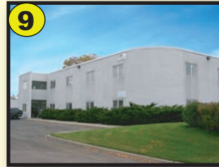
949 Concord 1,200 to 5,400 SF