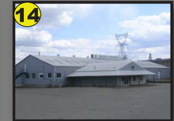
500 Malden St 4 Acres Outside Storage