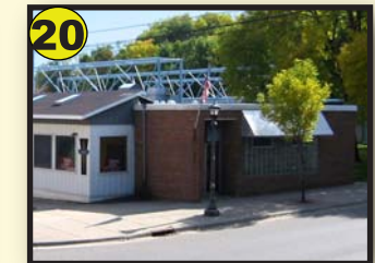
432 Wabasha St 2,725 SF $300,000