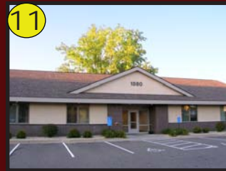
1560 Livingston 3,000 SF $399,000