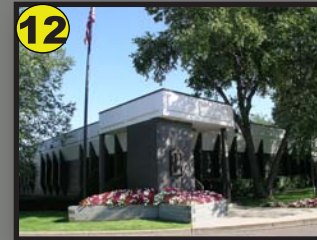
150 Marie Ave E 7,000 to 8,100 SF