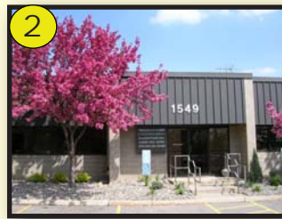
1549 Livingston 400 to 910 SF