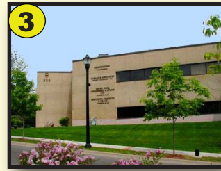
222 Grand Ave 2,250 SF