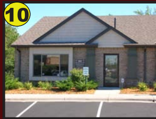
5882 Blackshire 2,600 SF $349,000