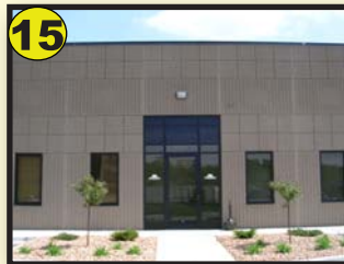
393 Hardman Ave 2,900 SF $299,000