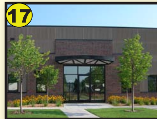
545 Phalen Blvd 4,100 to 13,400 SF $79/SF